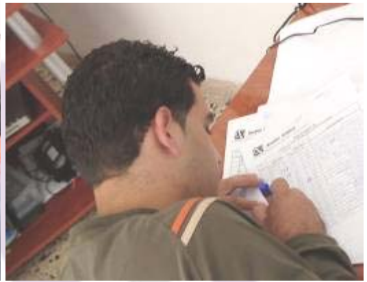
The working groups in process.